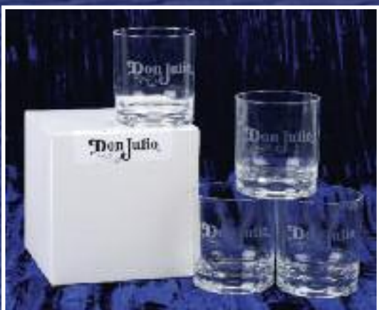
CREATE A GIFT SET SEE PAGE 13